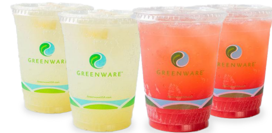
Sparkling Agave Lemonade