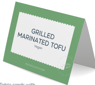
Table cards with allergens included!