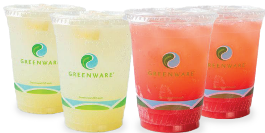
Sparkling Agave Lemonade