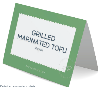
Table cards with allergens included!

Brown Rice Sushi Rice Brown Rice-Quinoa Blend Mixed Organic Greens Add Third Base +2 pp